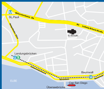
MV “Cap San Diego” at the Hamburg Harbor

Überseebrücke 20459 Hamburg www.capsandiego.de