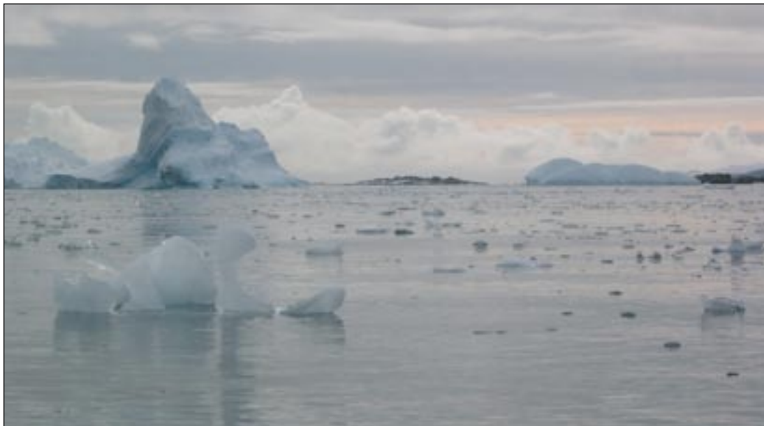
Melting sea ice near the Antarctic Peninsula.