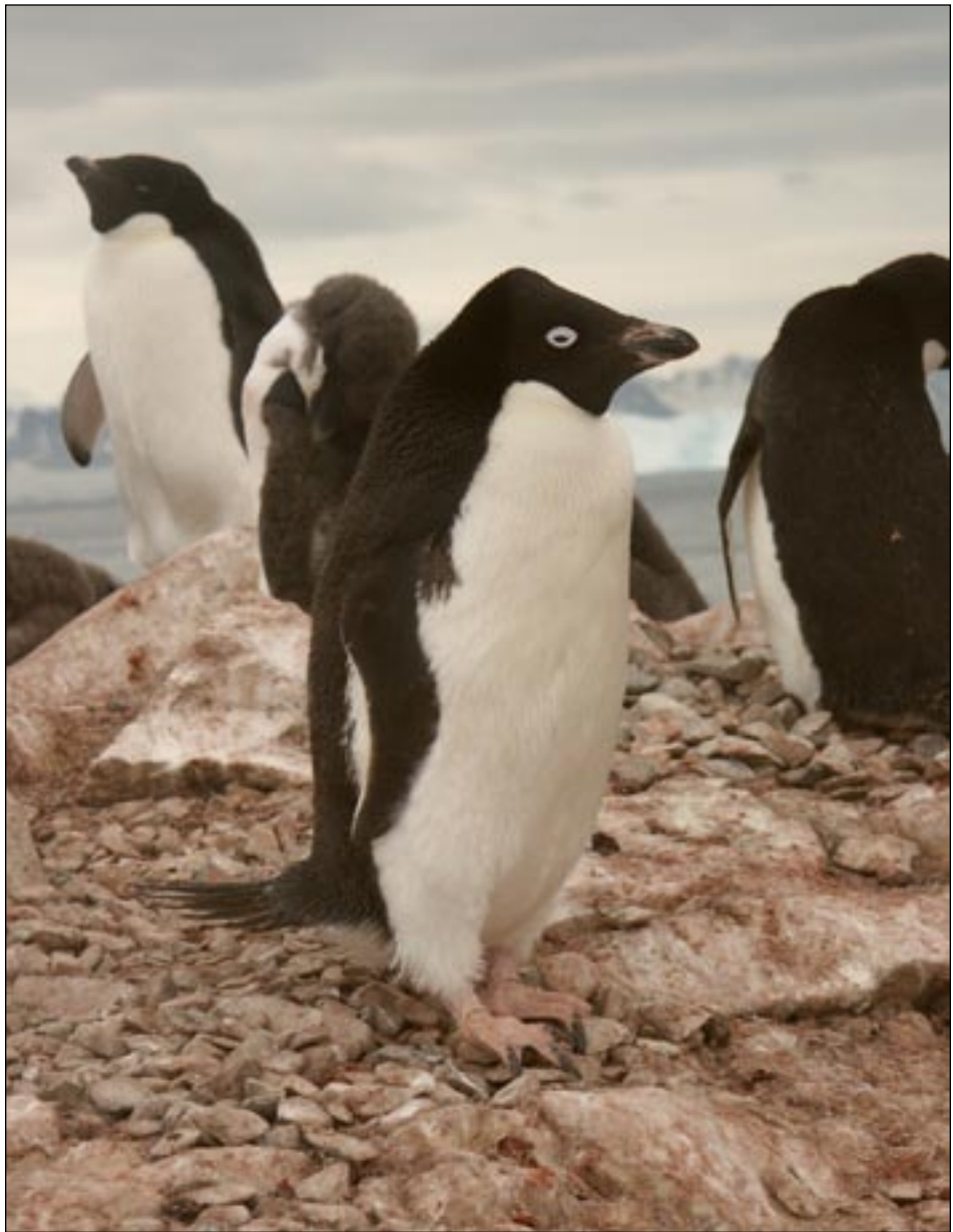
Adelie penguins in the Antarctic.