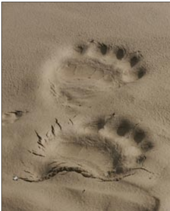
Researchers believe that reduced sea ice caused by global warming could create problems for polar bears who normally live and hunt on pack ice.