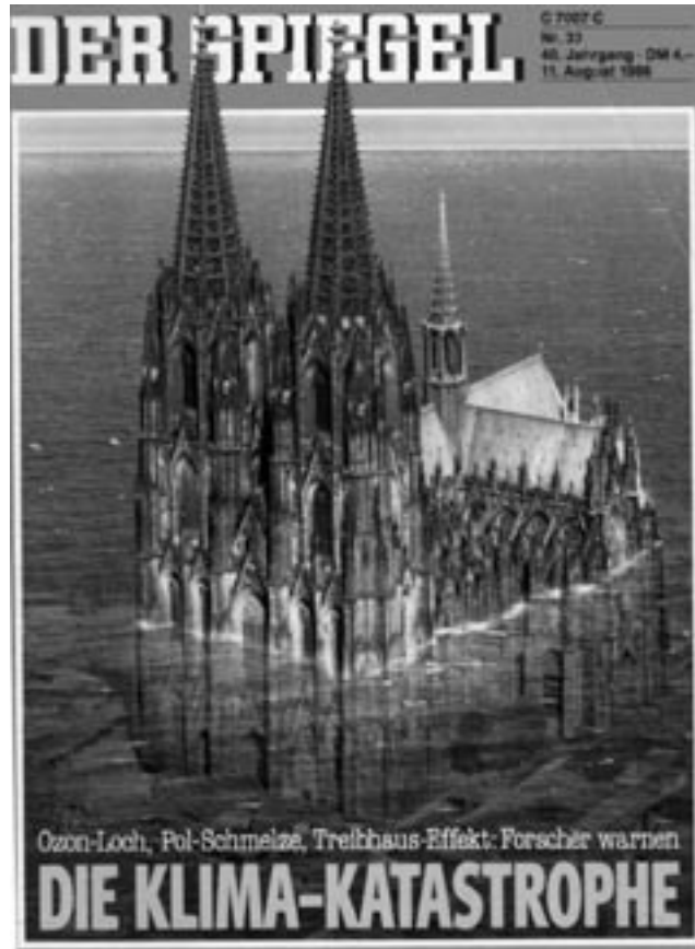
In 1986, Der Spiegel's cover of the Cologne Cathedral half submerged in a flood became an iconic image for the German attitude towards climate change.

While in the United States, the words global warming refer to a tendency towards warmer conditions, climate change in Germany is framed more broadly, equated foremost with Klimak-